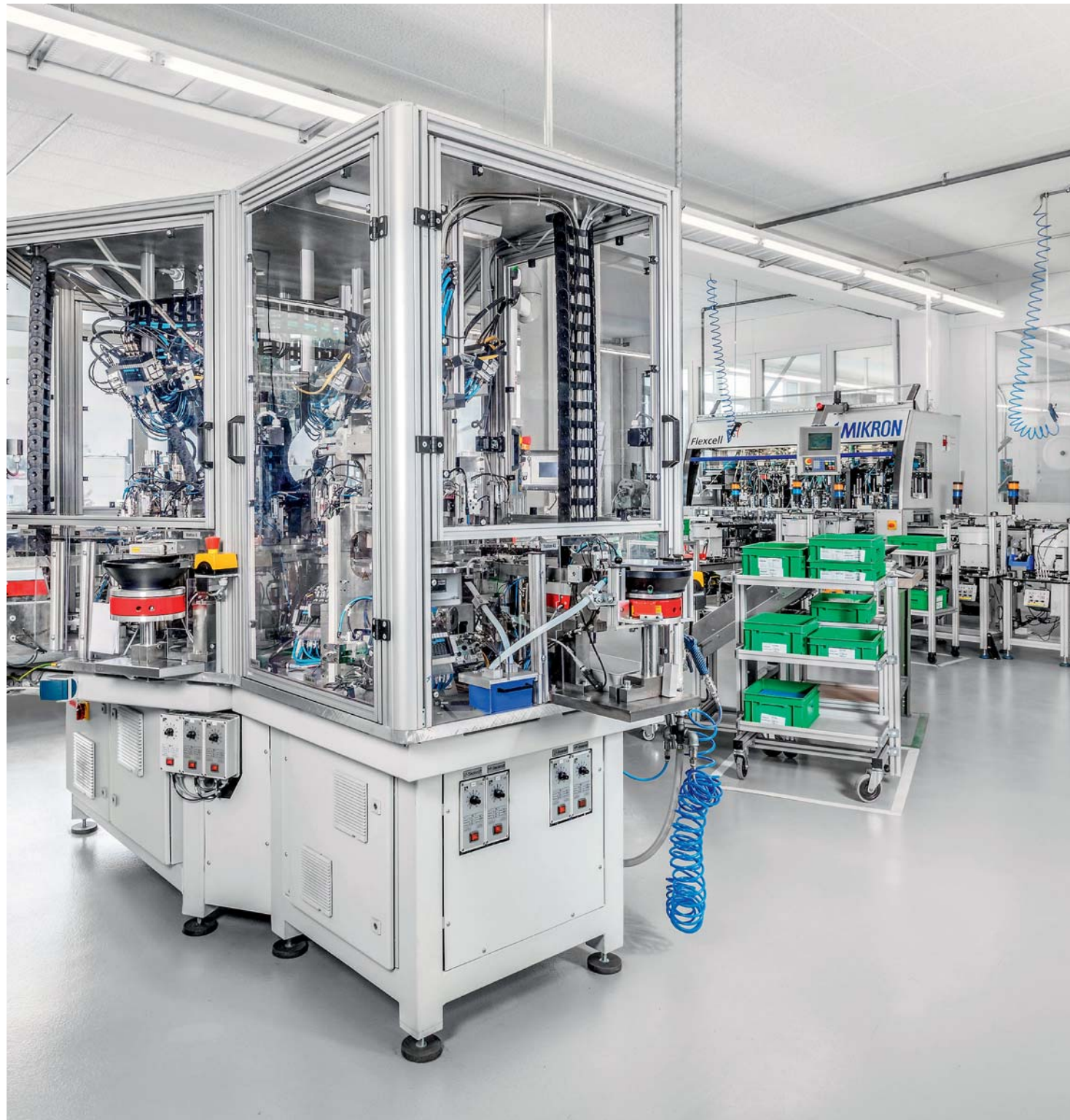
Standard fiber optic components