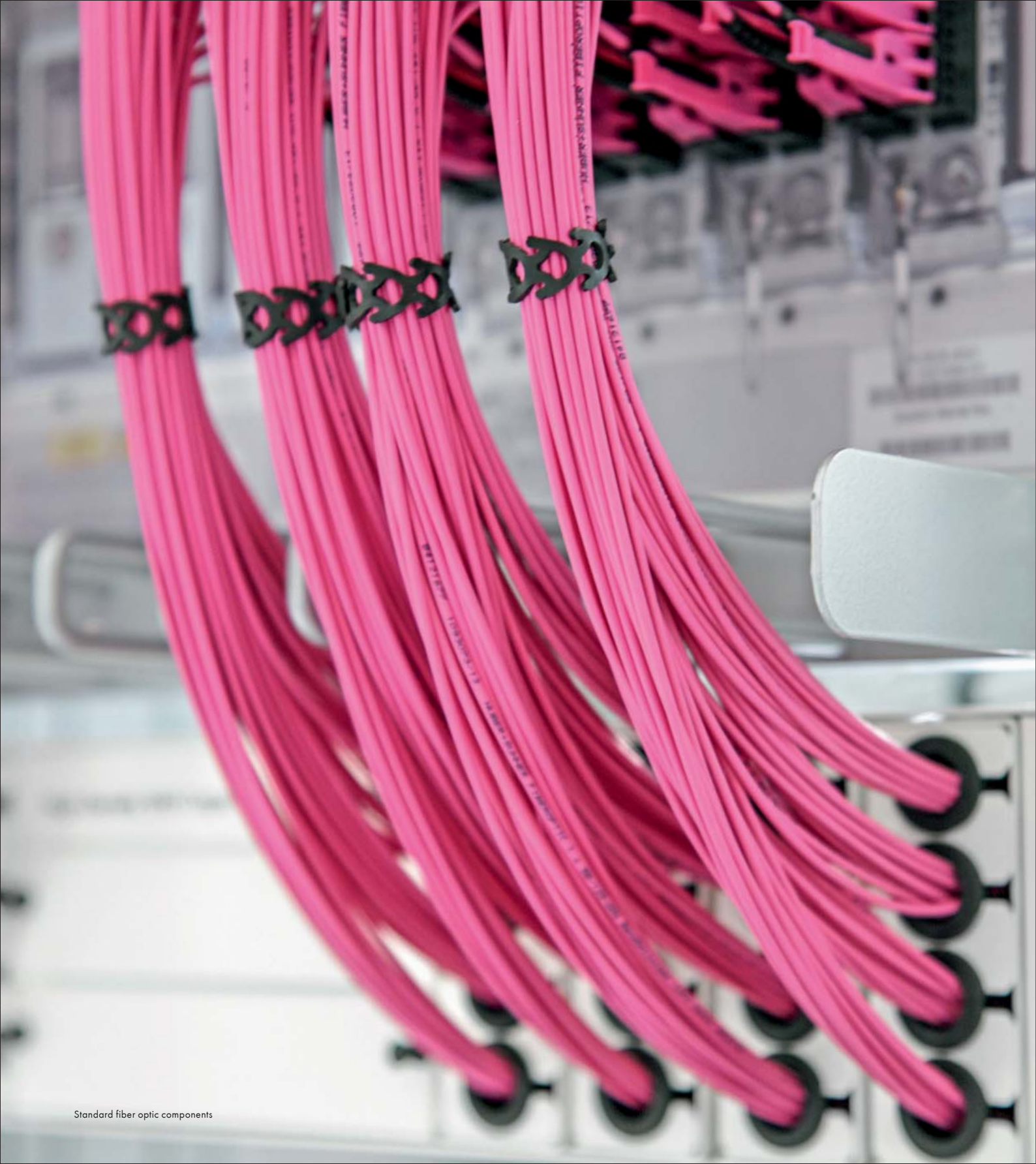
Standard fiber optic components

HUBER+SUHNER places value on fiber optic standard products: Discover the many advantages which make our connectors, adaptors, pigtails, patch cords and cables the first choice for innovative FO solutions. You will find further good reasons at: